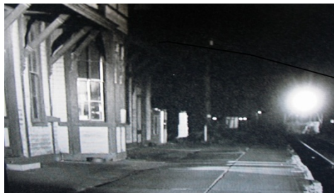
Old Highland RR Station (a.k.a. Mapleton)

Highland Historical Society P.O. Box 51 Highland, Illinois 62249