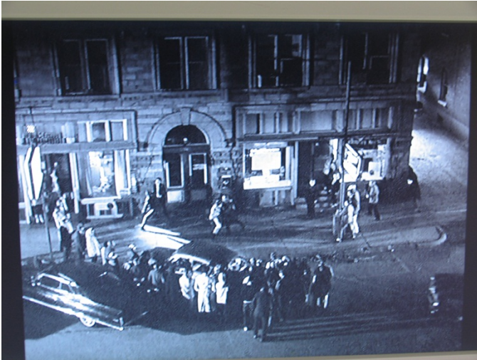
Broadway and Washington