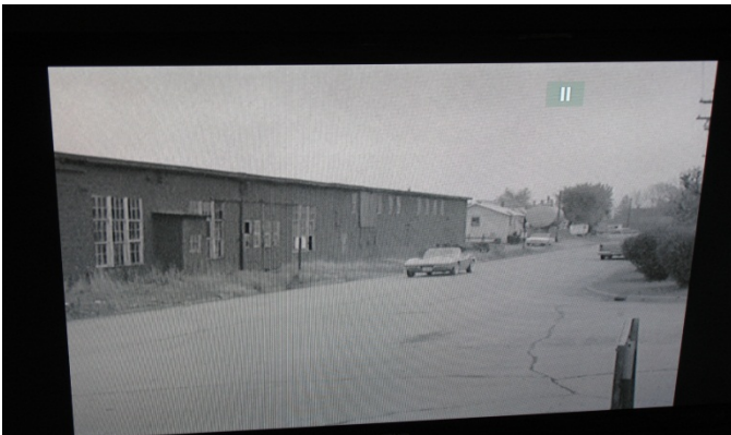
Hagnauer & Knoebel warehouse on 6 th St.